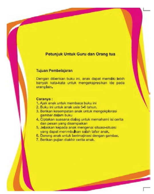
Figure 3. Page Instructions for Parents and Teachers

The guidance page is provided as a procedure for both teachers and parents when practising storytelling skills.