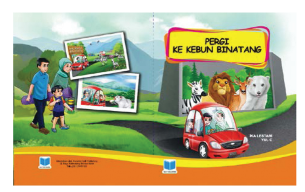
Figure 1. WPB Coverage Page

The starting and back page designs include the title of the book, author's name and illustrator, as well as the name of the publisher. The cover page design is tailored to the characteristics of children aged 5-6 years.