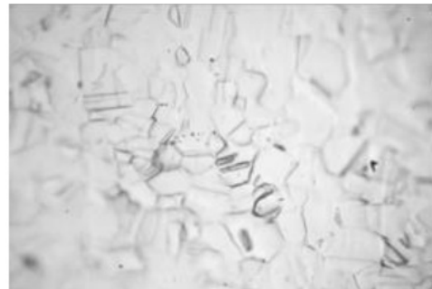
Fig. 2. The microstructure results from the condenser tube, 400X magnification.

This is the same as the statement of J. Paul Guyer (2013) that the tube material used for the specification of water cooling freshwater with a specific conductance of 2000 - 9000 Ms/cm and chlorine content of 250 - 1500 Mg/L is SS 304.