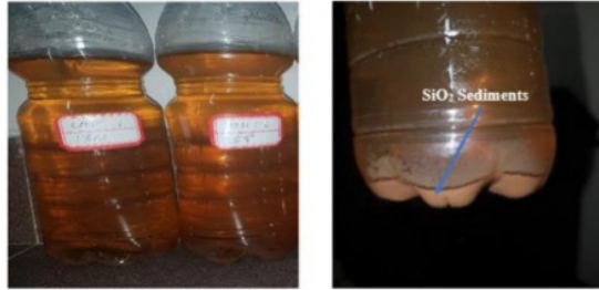
Fig. 3. Condition of Air Cooling Tower

NTU, where this value exceeds the standard that is <15 NTU. Tests were also carried out on cooling water and turbidity values obtained 227.86 NTU and Total Suspended Solid (TSS) 236 mg/L. The application of chemicals in the water treatment system has not been maximized and solid particles from the Siak river water are still carried away, which can be seen in Figure 3.