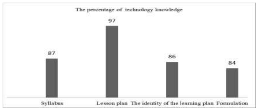
Figure 2 The Percentage of the Students' Technological Knowledge

Based on the picture above, the cognitive aspects of the designed learning media had the lowest score of 88, while the aspects of media integrity and overall functions obtained the highest score of 100. The data shows that the students' Technological Knowledge can be categorized as "very good".