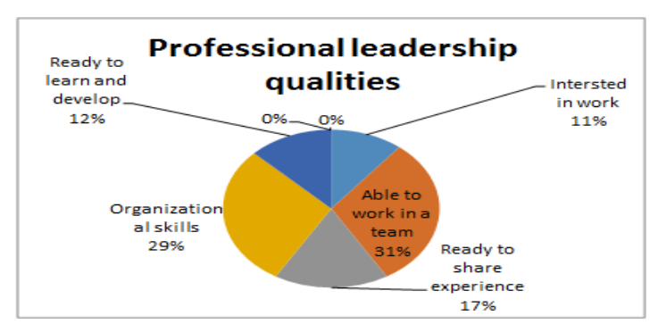
Figure 2 The Importance of Professional Qualities of a Teacher Leader

It can be concluded that according to the respondents, the most important personal qualities are the ability to make decisions, express one's own opinion and put forward new ideas. It means that most of the respondents believe that a teacher leader is the person who holds a leadership position and makes any changes in the educational process. It is quite strange that the characteristic "not prone to conflict" was given a rather low degree of importance. As for professional qualities, the highest results were given to such qualities as "ability to work in a team" and "organizational skills". The option "ready to share experience" is considered to be slightly less important. The professional qualities most favored by the respondents partially overlap with the personal ones. They confirm the assumption that the respondents define a leader as a person able to lead others. This suggests that the surveyed teachers and lecturers have a common definition of leadership, which may partly exclude personal leadership that affects professional competence.