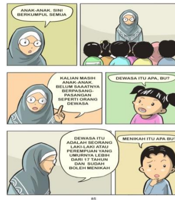
Figure 2. The instruction to use the book