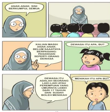
Figure 3 Smart Information

BUSAPAKSA design contained CSA material in story approach. Rahmawati (2012) says that an accurate social story strategy, which describes situations and pure comic conversation by using visual symbols, abstract conversational concept and columns which indicate emotional content, can improve the students' understanding on sexual education. BUSAPAKSA consisted of seven stories, which were as follows: (1) recognizing and maintaining My body parts; (2) Recognizing Family Members; (3) Computer and Internet Learning; (4) Recognizing the Police Offices; (5) Going to the Zoo; (6) Fishing in the River and (7) Being Adult Game