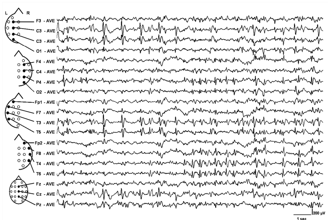
Figure 2. EEG-recording showing independent spike and wave activity from both hemispheres during sleep.

electrodes placed on the surface of the brain or in the brain tissue may be applied in potential epilepsy surgery cases as part of a pre-surgical investigation.